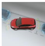
Front and rear parking sensors