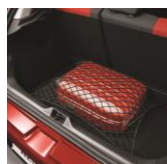
Luggage boot net