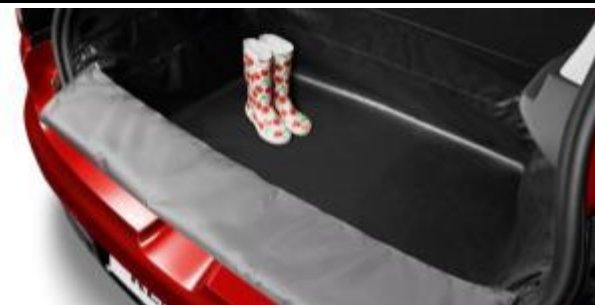
Luggage compartment stain protection

Semi rigid material, reversible textile-rubber.