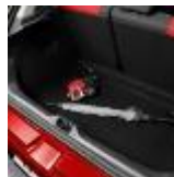
Reversible boot liner