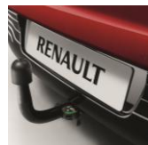
Quick release towbar