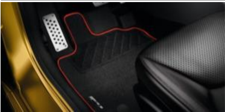
Renault Sport textile