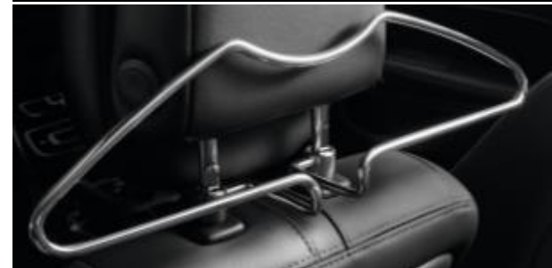
Hanger for headrest

Capacity: 24 L. Supply: 12 V / 230 V socket.