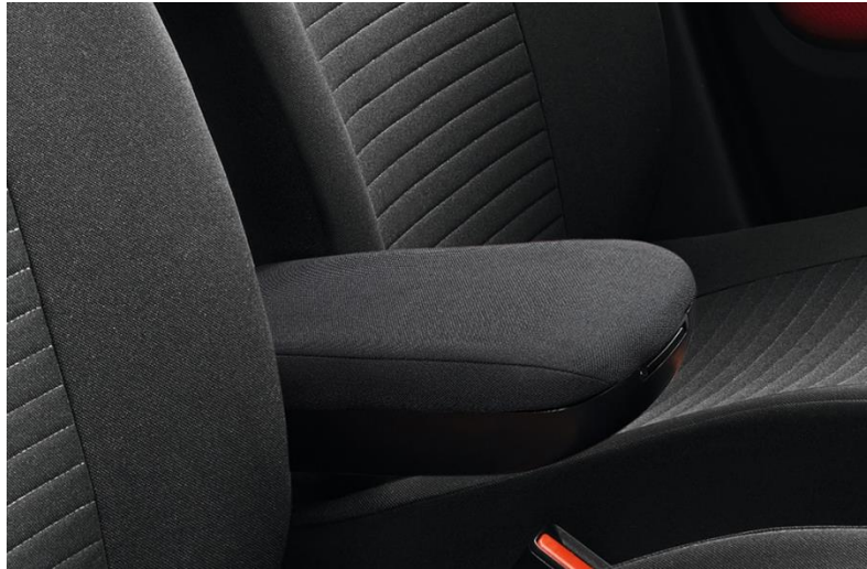
Front carbon armrest

Renault's range of accessories includes a central armrest that provides optimum driving comfort and additional storage space.