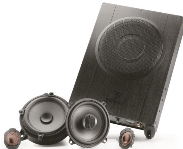
FOCAL Music Premium speakers

Wired audio headset. Supplied with remote control for iPhone, cable jack and rigid storage case.