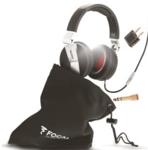
FOCAL Spirit One headset

Set of 4 loudspeakers in 2 separate channels (tweeters on dashboard). Improved sound staging. Max. power: 100 W.